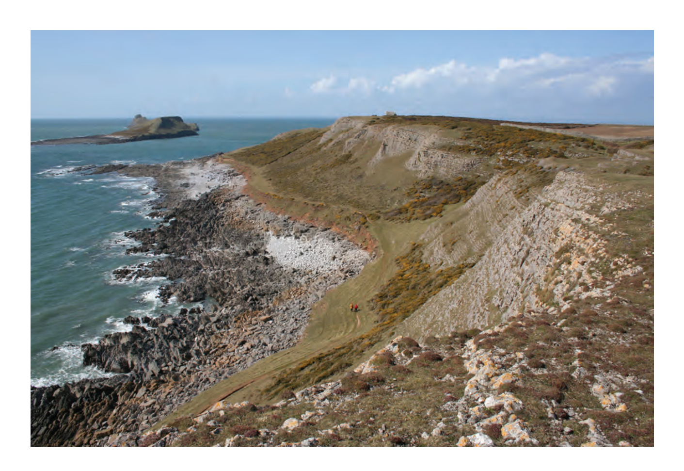
Fig. 3 A photograph and a field sketch of the same area, used in a geographical investigation